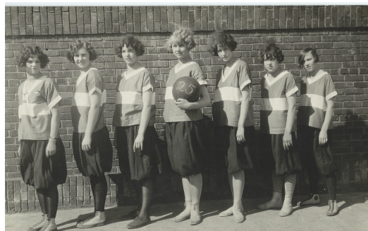
The girls team postcard is from the Gene Step collection