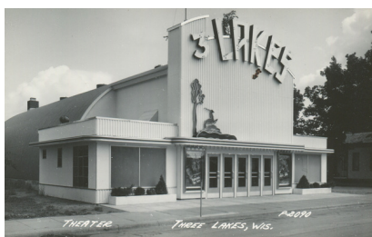
3 Lakes Theater today the TL Center for the Arts