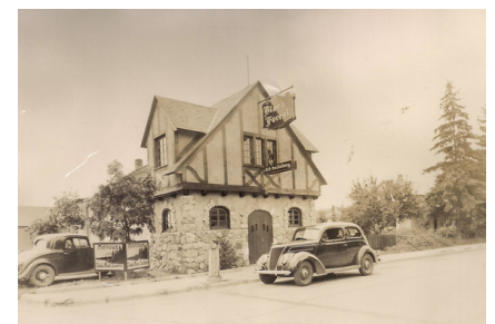
The Black Forest