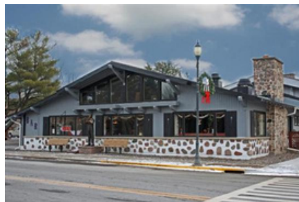
Oneida Village originally the Alpine Motor Inn